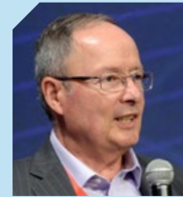
GEN (Ret.) Keith Alexander Founder, Chairman and Co-CEO, IronNet Cybersecurity